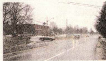
The intersection of Academy and Vine Streets on Route 236 are a concern for the Corridor Committee.

The committee also wants to focus on the high crash areas such as the intersection at Academy and Vine Streets in South Berwick and other intersections like that one.