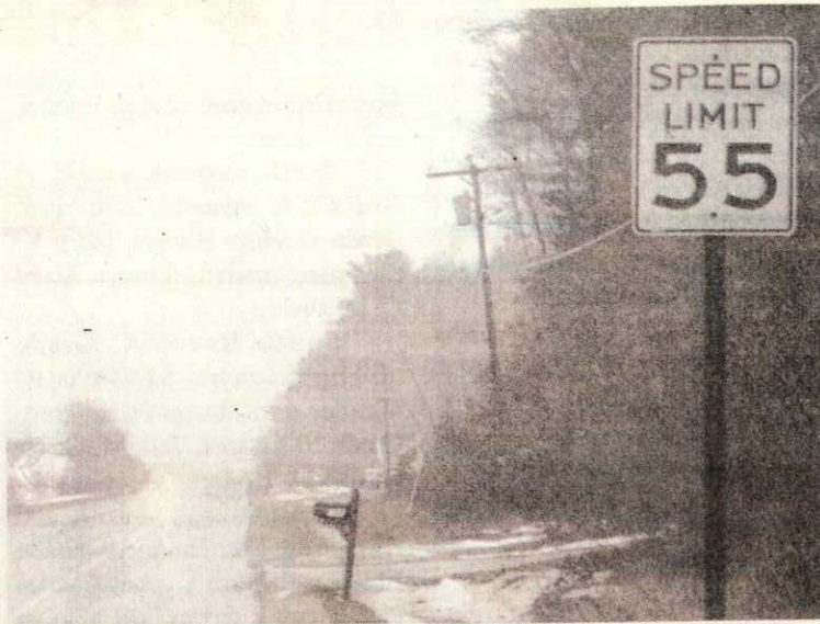
A possible reduction of speed limits on Route 236 may take place depending on the outcome of a study done by Maine Department of Transportation.

A year long study is currently taking place with the Maine Department of Transportation (MDOT). The study focuses on traffic in the problem areas and identifies the problems having to do with dangerous intersections, speed