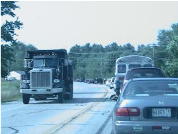
Commuters, transit, and commercial truck traffic on the Route 236. We all have a stake.

Why an Action Plan for Route 236? Southern Maine is growing faster than any other region in the State, and nowhere are the effects of growth more readily apparent than on our highways. Geographically, Route 236 communities are on Maine's frontline, so to speak, facing these new growth challenges. While growth has been steady and gradual for a long time now, its cumulative effect has reached new thresholds that are seriously degrading our safety and mobility. Over the past twenty years traffic volumes on Route 236 have more than doubled—up to 18,000 Average Annual Daily Traffic in some locations. At present, there are currently 9 different Maine DOT-designated "High Crash Locations" on the 10 mile stretch from downtown South Berwick to the Kittery Traffic Circle.